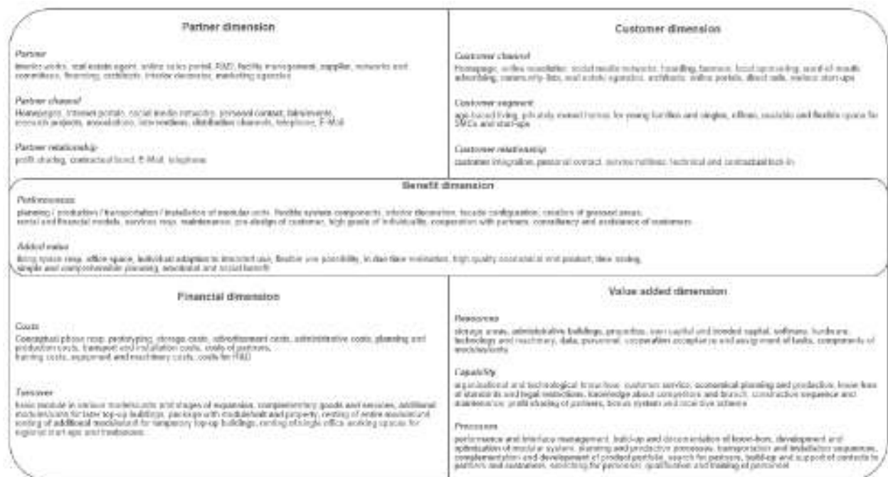
Figure 1: business model prototype for modular timber construction company in accordance to research project TU Graz (Heck et al. , 2016)

A business model prototype, like the final business model, is described by dimensions and represented in a business model matrix. The goal is to meaningfully combine the information gained from the respective SWOT-analysis in a business model matrix. The following prototype is based on an elaboration of the two phases of development described above and was established in a research project at the Institute for Construction Management and Economics at Graz University of Technology for a medium size Austrian timber construction company. The contents of a prototype are based on twelve analyzed business model approaches and several expert workshops (Heck et al. , 2016).